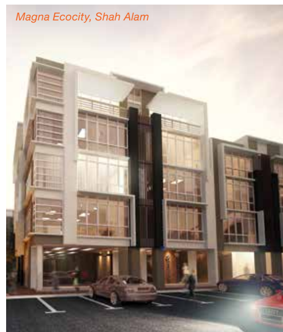
Magna Ecocity, Shah Alam