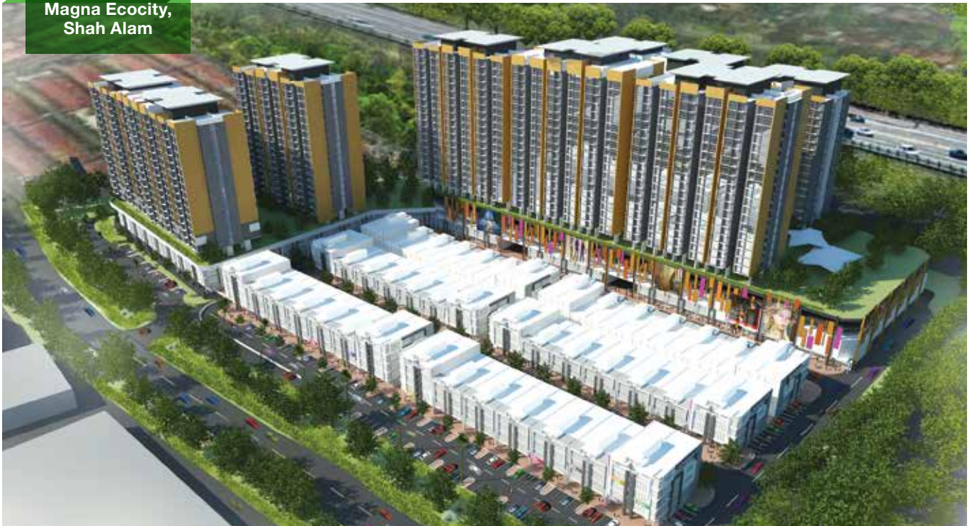
Magna Ecocity, Shah Alam

Magna Ecocity will offer a new social experience to the suburb.