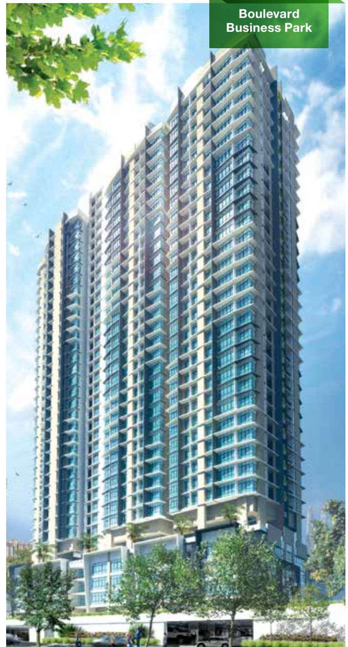
Boulevard Business Park