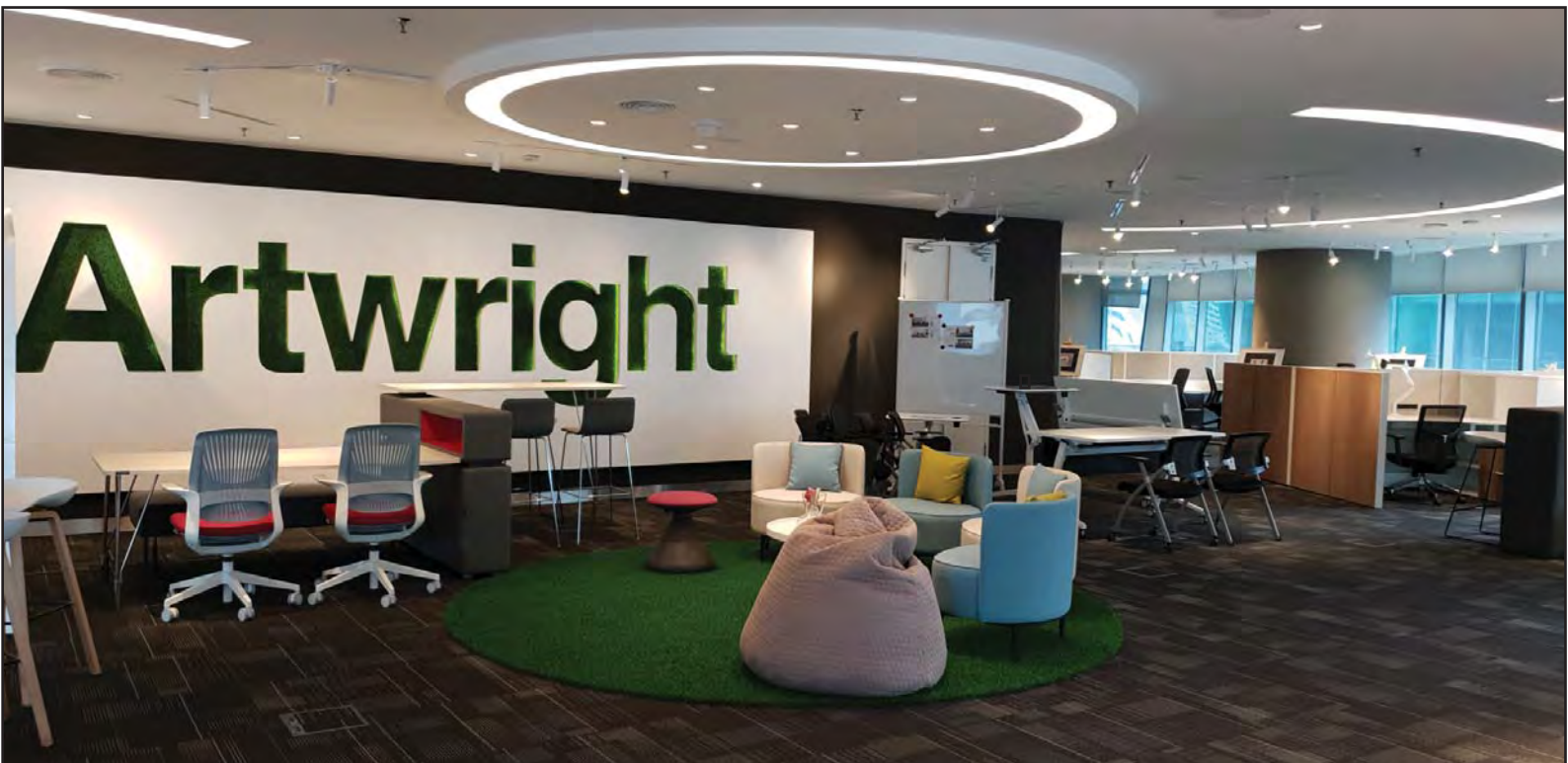
Artwright headquarters and showroom